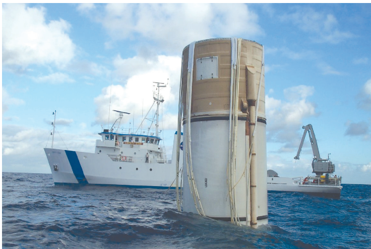
A retrieval ship arrives at a half-submerged solid rocket booster after a shuttle launch. Divers will prepare the booster under water to float horizontally and be towed back to Port Canaveral.

The ship's complement includes a crew of 10, a nine-person booster retrieval team, a retrieval supervisor and observers. The maximum complement is 24 people.