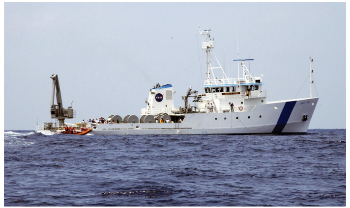
The Liberty Star on the Oculina Banks helping researchers who wanted to characterize the condition of the deep-sea coral reefs and reef fish populations on the banks, located 20 miles offshore of the east coast of Florida..