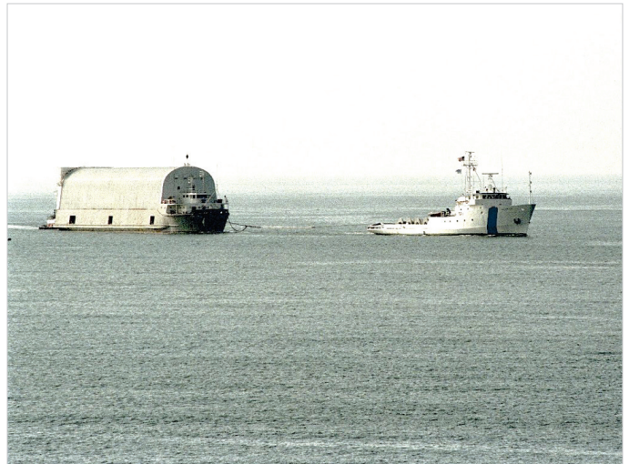
Freedom Star tows a barge with an external tank into Port Canaveral for the first time.

In the fall of 2002 and the spring of 2003, both Liberty Star and Freedom Star supported a National Oceanic and Atmospheric Administration-sponsored undersea expedition. The mission was to characterize the condition of the deep-sea coral reefs and reef fish populations in the Oculina Banks. The marine-protected area is located 20 miles offshore of the east coast of Florida. Equipment used for the research included an