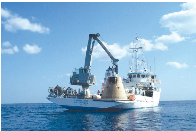
(Left) The frustum is lifted from the water by a power block attached to the ship's deck crane.