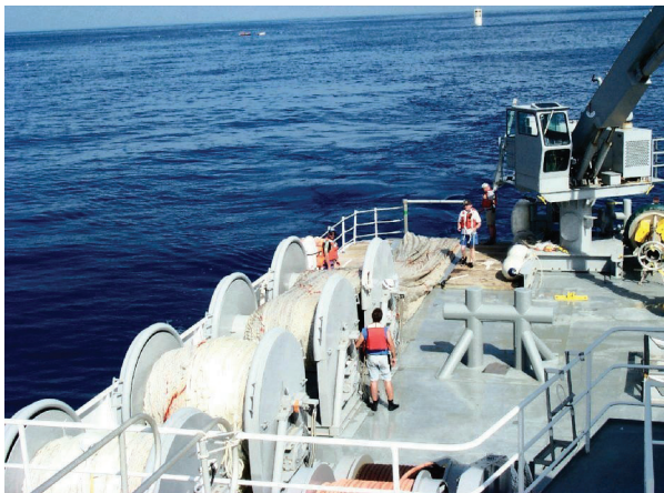
(Above left) The drogue chute is wound onto a reel on deck.