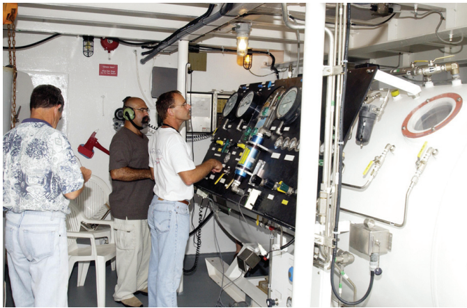
A dive medical technician on the Freedom Star monitors a recompression chamber to help a lobster diver who suffered distress after a dive off Cape Canaveral.