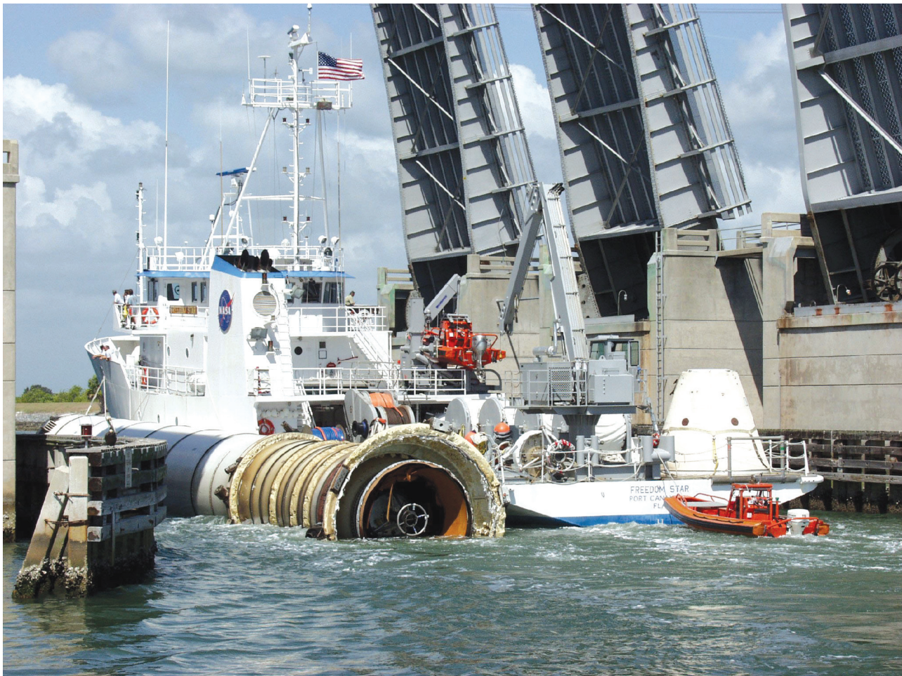
With the booster now alongside in the hip tow position, the ship passes through a drawbridge and Canaveral Lock to the Banana River on its way to Hangar AF.