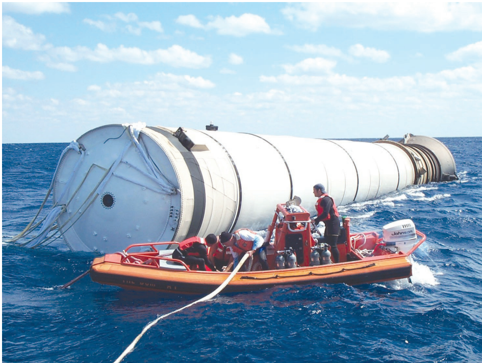
(Left) Divers attach tow lines to the floating booster.