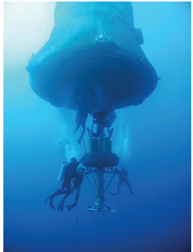
(Above) Divers insert an Enhanced Diver-Operated Plug into the booster nozzle, displacing the water and causing the booster to assume a semi-log or horizontal position.