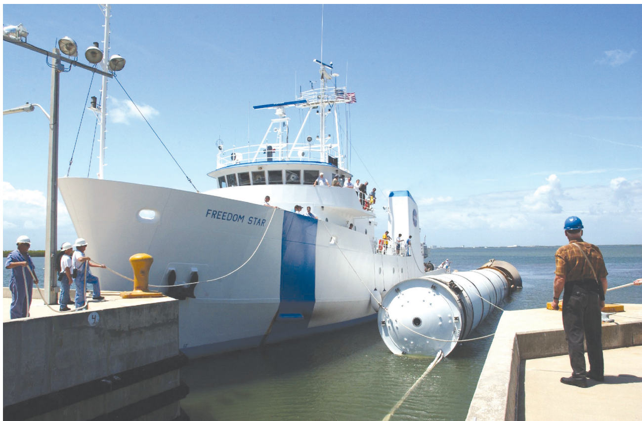
At Hangar AF, the booster is released from the ship. It will be towed to a position where Straddle-Lift cranes can lift it from the water and place it on a rail car for disassembly.

The retrieval ships played key roles in two rather unusual activities in 2002 and 2003.