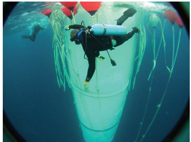
(Top left & right) The ship locates the booster, divers separate the chutes; (left) the ship retrieves the chutes.