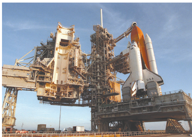
The Rotating Service Structure (left) is rolled open for launch. Entry to the Payload Changeout Room is exposed.

The major feature of the RSS is the Payload Changeout Room, an enclosed, environmentally controlled area that supports payload delivery and servicing at the pad and mates to the orbiter cargo bay for vertical payload installation. Clean-air purges help ensure that payloads being transferred from the payload canister into the Payload Changeout Room are not