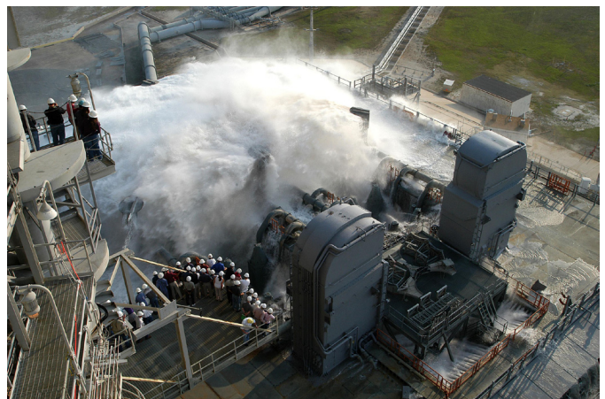
(Below Left) Water is released onto the Mobile Launcher Platform on Launch Pad 39A at the start of a water sound suppression test.

The system reduces acoustical levels within the orbiter payload bay to about 142 decibels, below the design requirement of 145 decibels.