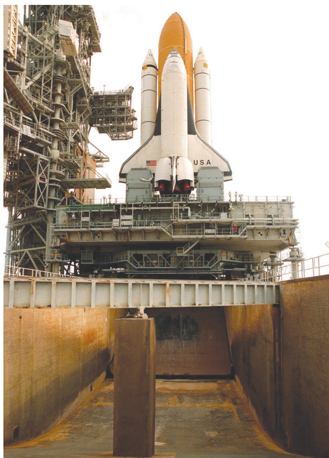
The Shuttle and MLP sit above the flame trench.

The flame trench, built with concrete and refractory brick, bisects the pad at ground level. (See photo at right.) It is 490 feet long, 58 feet wide and 42 feet deep. The flame deflector system includes an inverted, V-shaped steel structure covered with a high-temperature concrete material five inches thick that extends across the center of the flame trench. One side of the "V" receives and deflects the flames from the orbiter main engines; the opposite side deflects the flames from the solid rocket boosters. There are also two movable deflectors at the top of the trench to provide additional protection to Shuttle hardware from the solid rocket booster flames.