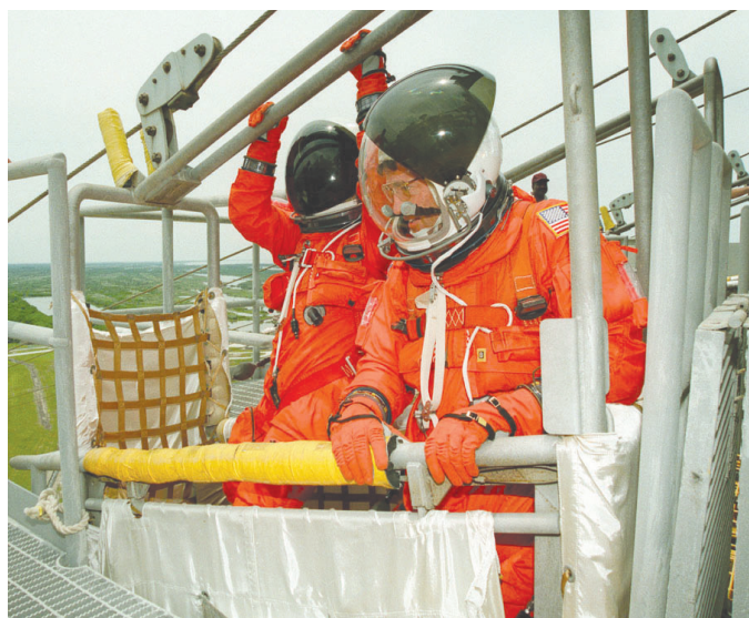
Astronauts climb into the slidewire basket on the Fixed Service Structure. The basket is part of the emergency egress system.

The system includes seven baskets suspended from seven slidewires that extend from the FSS to a landing zone 1,200 feet to the west. Each basket can hold up to three people (see photo above). A braking system catch net and drag chain slow and then halt the baskets sliding down the wire approximately 55 miles per