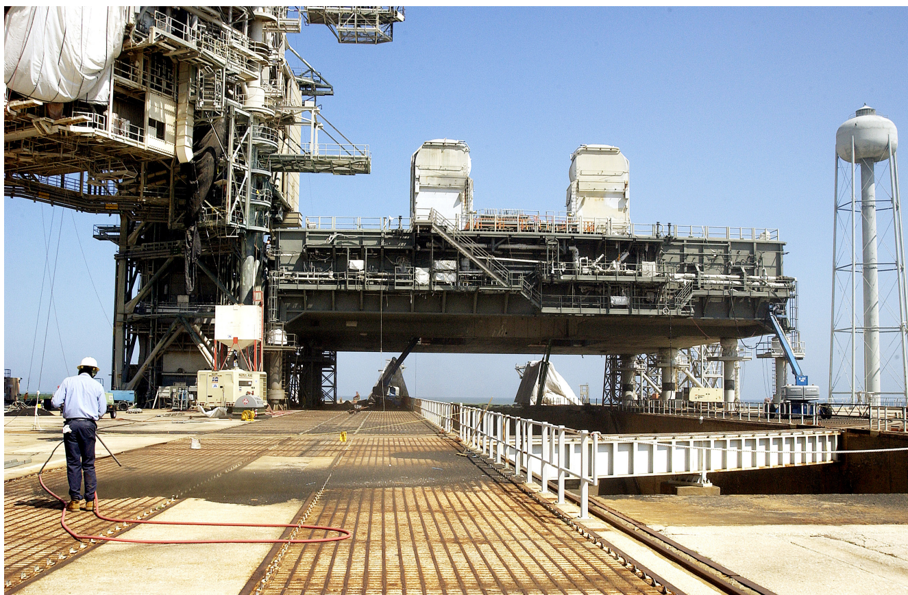
A worker sandblasts the surface behind the Mobile Launcher Platform on Launch Pad 39A . Routine maintenance includes sandblasting and repainting to minimize corrosion.

Corrosion of metal structures are endemic to the waterside environment. The metal pad structures are stripped and repainted on a recurring basis. Sand blasting and repainting are best done during a Mod Period because they stop all other work and create a foreign object debris situation.