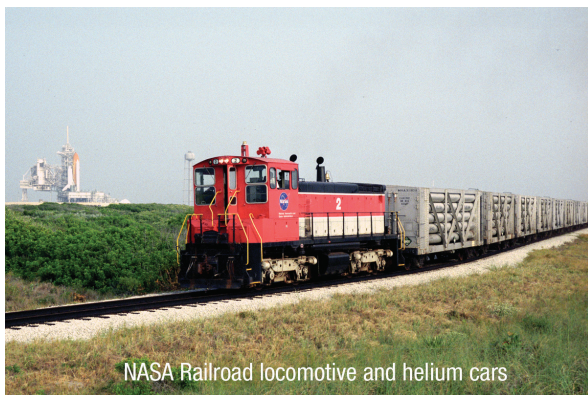
NASA Railroad locomotive and helium cars

The primary traffic on the NASA Railroad are the solid rocket booster segment cars. Each of the two booster rockets on the space shuttle consists of four segments, each 32 feet long and 12 feet in di-