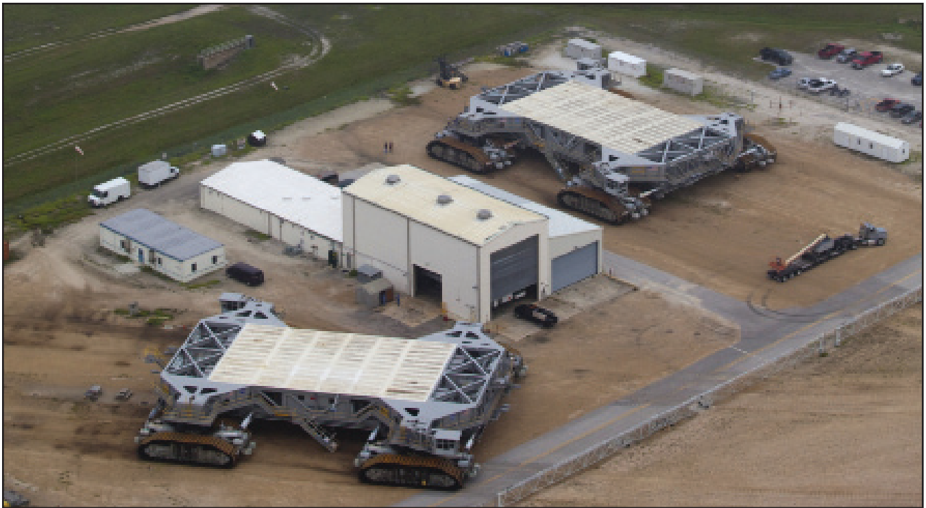
The crawler-transporters are seen from the tower of NASA's mobile launcher, or ML, at NASA's Kennedy Space Center in Florida on Aug. 12, 2010.