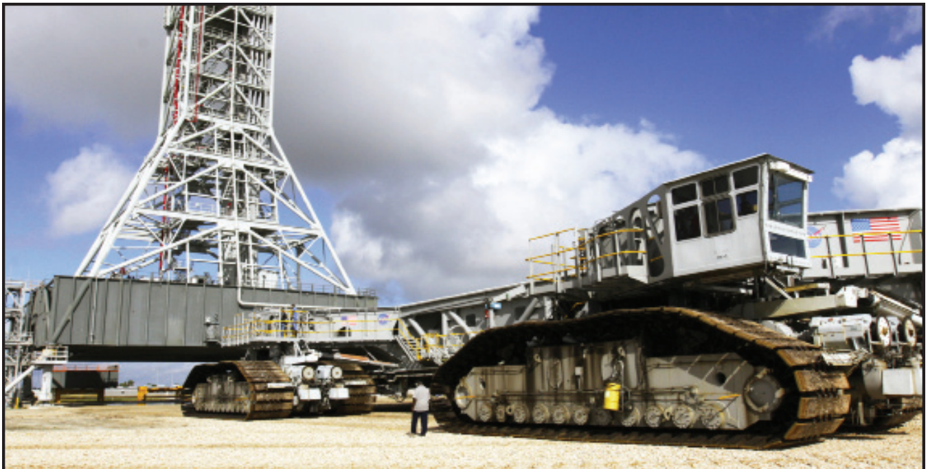
The crawler-transporter, carrying the mobile launcher (ML), is being prepared for a journey Nov. 15, 2011, to Launch Pad 39B at NASA's Kennedy Space Center in Florida.

National Aeronautics and Space Administration